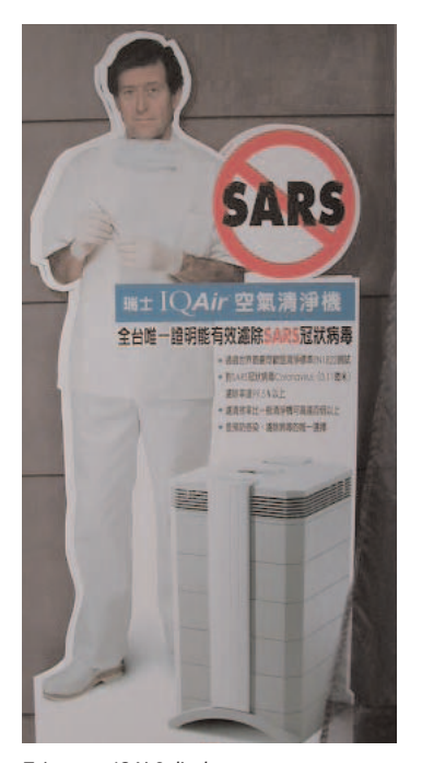
Taiwanese IQAir® display.

It is clear that vigilance for SARS must be maintained, because resurgence of the virus is possible. As a world leading manufacturer of mobile air cleaning systems IQAir® feel honoured and privileged to be able to play an important part in providing professional air cleaning solutions for the fight against SARS and other airborne infection control challenges.