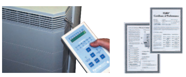
Each IQAir® HEPA filter system is individually tested for filtration efficiency and air delivery. The actual test results are documented on a numbered test certificate.

The efficiency tests quickly revealed that most of the air cleaners failed to remove airborne particulates with the required actual efficiency in excess of 99.97% for particles of 0.3 µm and larger. With its certified and independently type-tested filtration efficiency IQAir® passed this test. After the preliminary selection process, it was the EMSD's aim to select an infection control system that could be put into action in a matter of minutes and that would be able to effectively limit the threat of airborne disease transmission from a SARS patient to health-care workers by providing reliable and certified actual filtration performance.