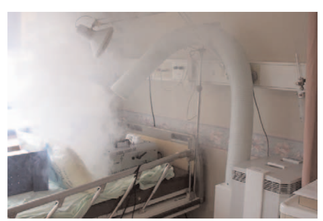
Testing the IQAir® in location. Artificial smoke is generated on a hospital bed and then captured at source with the help of the IQAir® FlexVac<sup>TM</sup>s flexible suction arm.

Thanks to the professional effort of a Hong Kong based authorised IQAir® dealership and IQAir®'s previous experience in the field of hospital infection control (see IQAir® press release "Decentralised Airborne Infection Control in Health-Care Facilities"), IQAir® was able to develop a tailor-made SARS control solution for the hospitals managed by the HKHA.