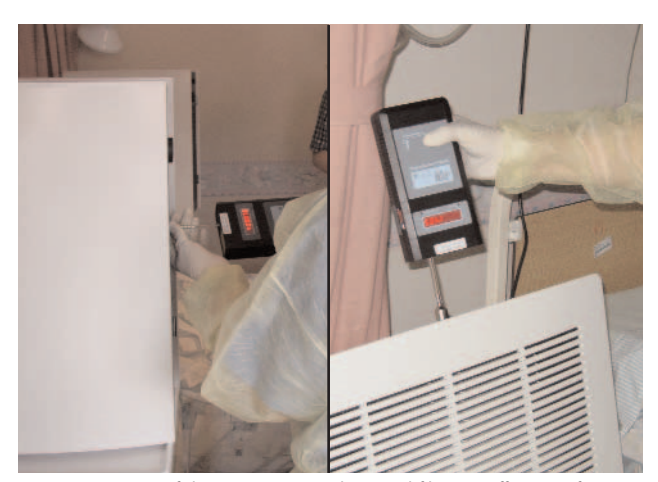
A Senior Engineer of the EMSD assesses the actual filtration efficiency of two air cleaners with a laser particle counter. The majority of conventional air cleaners failed the efficiency test.

In order to find the most efficient, reliable, flexible and cost effective solution, the Electrical and Mechanical Services Department (EMSD) of the Hong Kong Government performed rigorous tests on behalf of the HKHA. They evaluated the suitability and performance of many filtration systems, including IQAir®. With the help of a laser particle counter the EMSD tested the actual filtration efficiency of each filtration system.