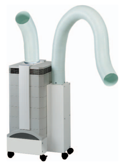
The customised IQAir® filtration solution for the Hong Kong Hospital Authotrity combines an IQAir® filtration system with the FlexVac™ source capture kit and special flexible OutFlow™.

filtration process. At the final filtration stage IQAir®'s independently type-tested HyperHEPA® filter removes even the tiniest of airborne microorganisms, including the SARS virus, with an efficiency in excess of 99.5%. As a result the risk of infection within the patient's room can be greatly reduced, thus providing a safer working environment for health-care personnel and limiting the risk of spreading the disease.